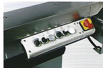
Multi-function option control panel