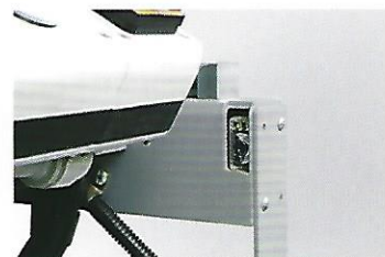
Security protective sensor